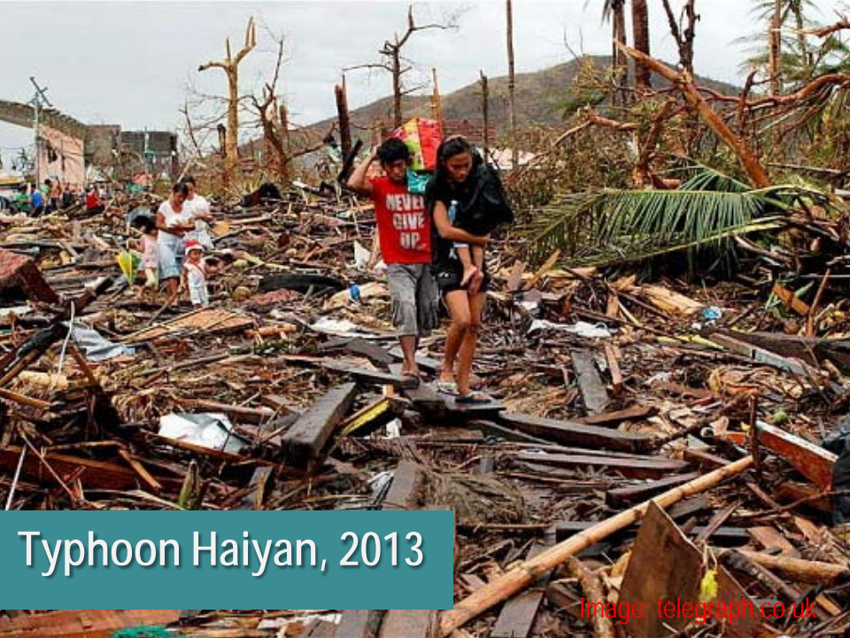
Typhoon Haiyan, 2013