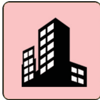
Common Infrastructure and Services