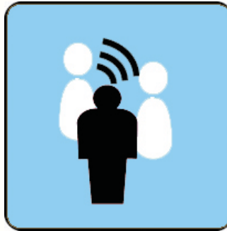
Awareness Raising and Capacity Building