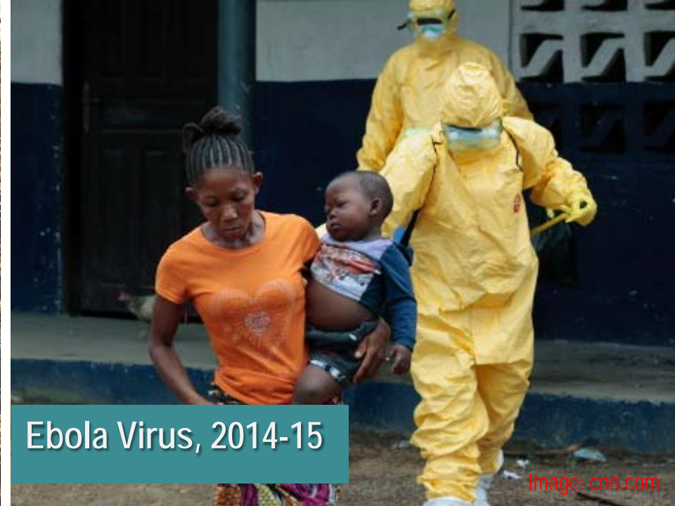
Ebola Virus, 2014-15