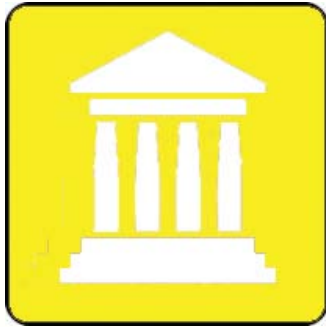
Governance and Policies